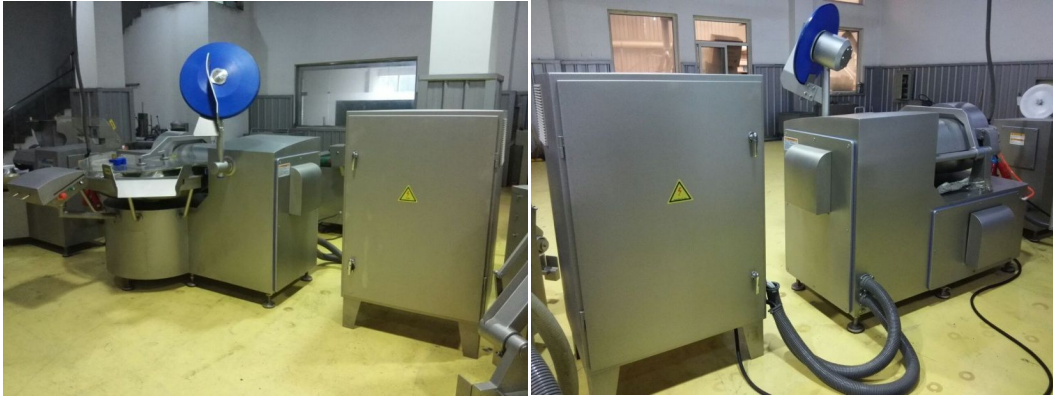
200 Ltr. Bowl Cutter with loader and unloader