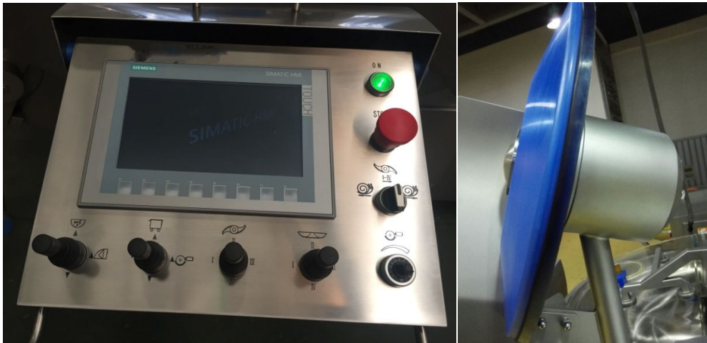
Panel with Joy sticks / Unlaoder Disk with sealing