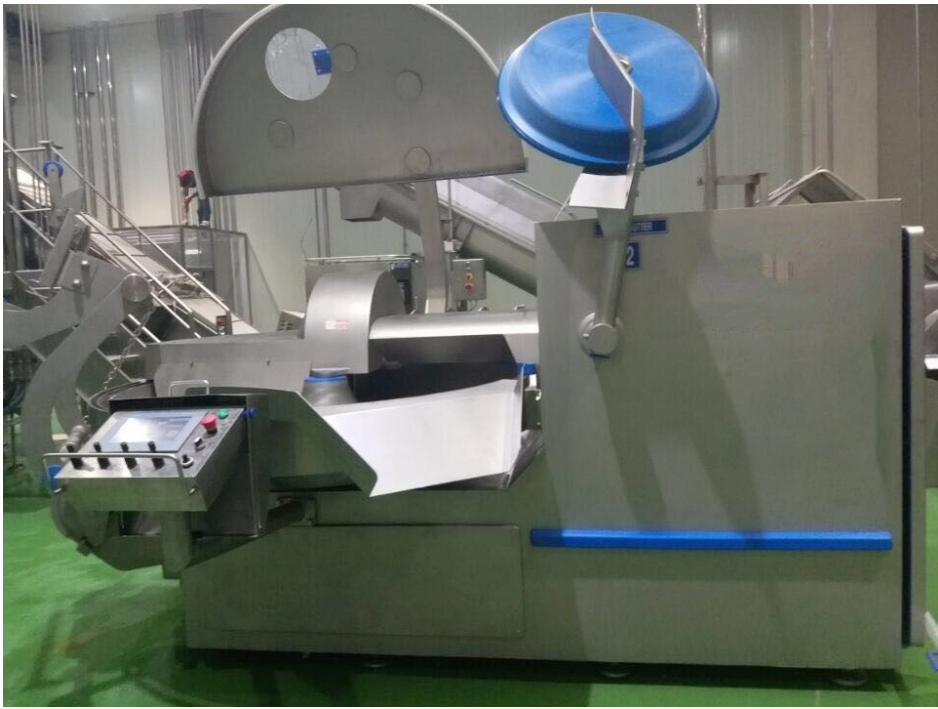
525 Ltr. Vacuum Bowl Cutter with loader and unloader