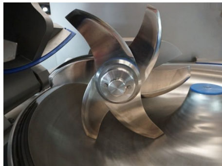
6 Knives with lock nut

All electrical and electronic components are integrated in either a separate self standing switch cabinet (200/300) or in the machine integrated switch cabinet (550) . The components are mostly from the German Brand Siemens. Heating elements and a fan avoid the appearance of condensation water. It is connected with the machine through a cable of 3 m standard length.