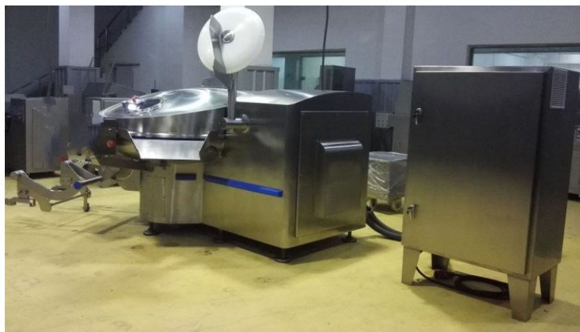
200 Ltr. Vacuum Bowl Cutter with loader and unloader