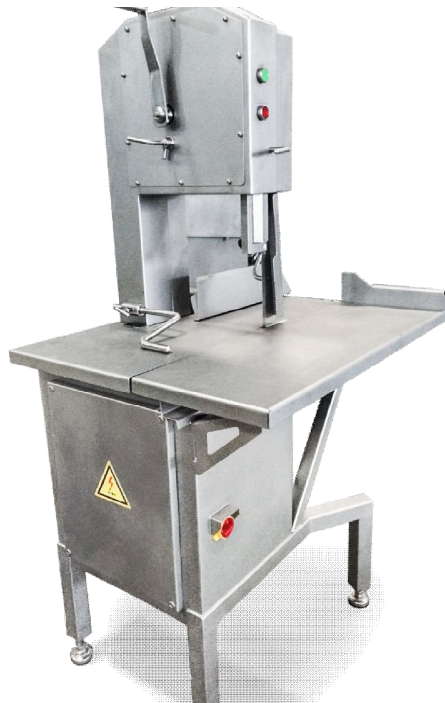
Band Saw KBS 300

The Band Saws are available in two different models