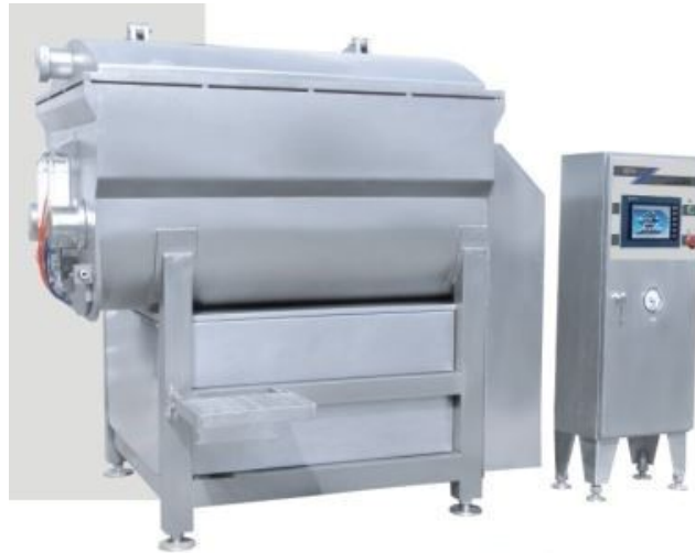
1200 Ltr. Vacuum Mixer