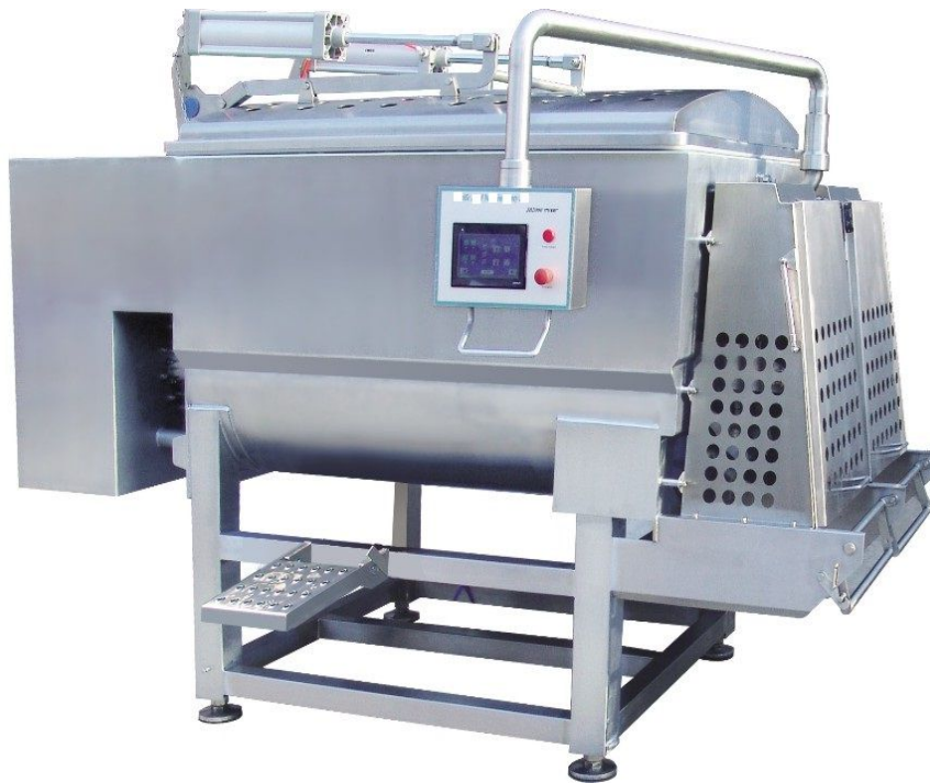
2000 Ltr. Vacuum Mixer

“THE CLASSICAL” Series of Food Machines fulfil the requirements of most of the customers worldwide. The classical design and the very competitive equipment components are topped by an excellent cost performance ratio.