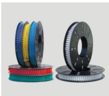
Great Wall aluminum

The KDC 12/15/18 matches with different type of clips: